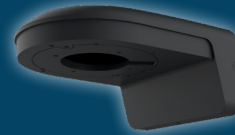
Wall Bracket CODE: VIP-WALL-BK0203-G